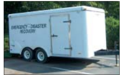
14-Foot Tandem Enclosed Trailer

Submit sealed bids to: Randolph Telephone 3733 Old Cox Road Asheboro, NC 27205