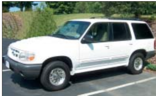
2001 Ford Explorer with 99,160 miles