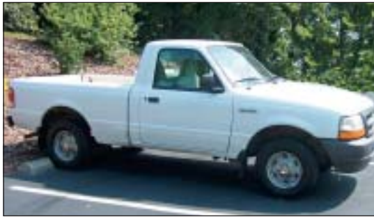
1 of 2 1998 Ford Ranger Pick-Up Trucks